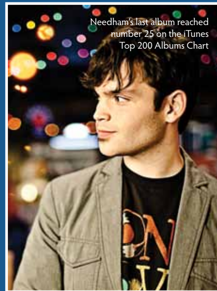
Needham's last album reached number 25 on the iTunes Top 200 Albums Chart