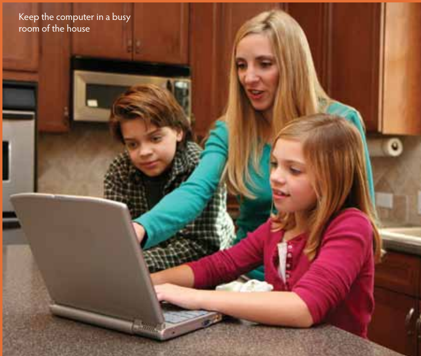
Keep the computer in a busy room of the house

If parents notice a child is receiving or making odd or secretive phone calls, parents need to step in. Parents should regularly check the home phone bills and cell phone bills for any unusual activity, noting the times the calls are made.