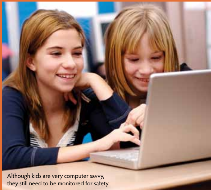
Although kids are very computer savvy, they still need to be monitored for safety

Another red flag is when children quickly click off what they were viewing when a parent enters the room. It's important to find out why and start investigating. If a child suddenly starts talking about a friend you've never met, ask questions and find out how the child knows this new friend.