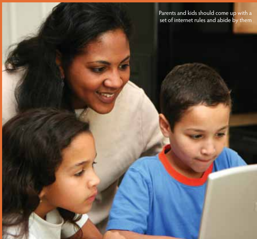
Parents and kids should come up with a set of internet rules and abide by them