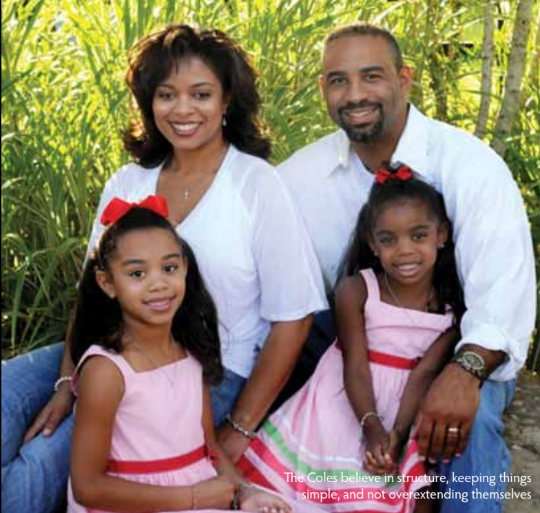
The Coles believe in structure, keeping things simple, and not over-extending themselves