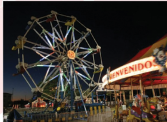
Local kids enjoy carnival rides at the 1st Annual Katy Holiday Fun Festival.

The Katy Holiday Fun Festival was established in 2008 for the purpose of providing an exciting community based holiday event in the Katy area during an exciting time of year as well as a venue to raise donations for local charities. All proceeds will go to assist non-profit organizations and local families who are in need of cash, clothes, food, toys and gifts for the holidays. Unfortunately, there are families in our community and the surrounding area who are in need of the community's assistance during this season. In 2008 the Katy Holiday Fun Festival collected over $20,000 in food, clothes, and toys for the less fortunate families in the area as well as approximately $5000 in cash to Katy area non-profits such as Katy Christian Ministries, Breath of Life Children's Clinic and the Pregnancy Help Center in 2008. We were also able to personally touch several individual families with food, toys and cash for the holiday season. The first year was truly a blessing for all who participated and we look forward to this event growing tremendously in the years to come. 2009 already promises a great deal of growth and now is the time to join forces with what will become the fastest growing charity event in the area. Don't miss your opportunity to expose your organization to one of the most affluent and fastest growing communities even in the Houston area.