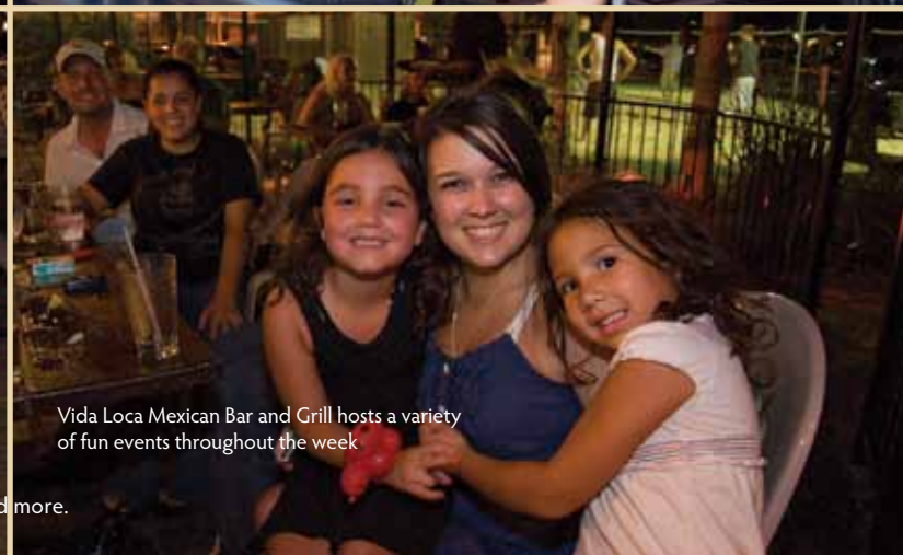
Vida Loca Mexican Bar and Grill hosts a variety of fun events throughout the week