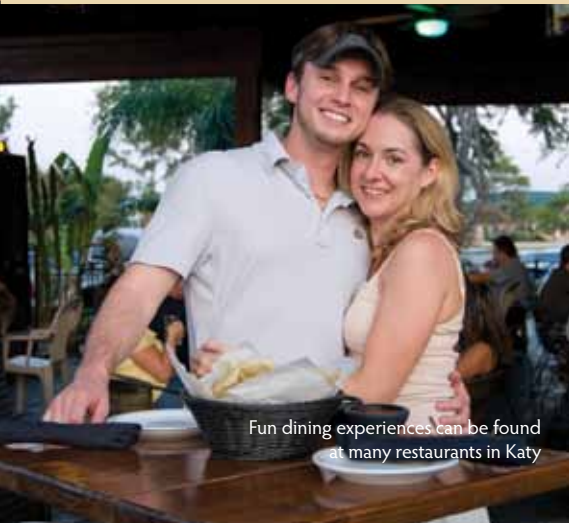
Fun dining experiences can be found at many restaurants in Katy