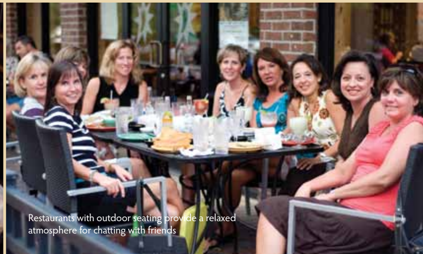
Restaurants with outdoor seating provide a relaxed atmosphere for chatting with friends