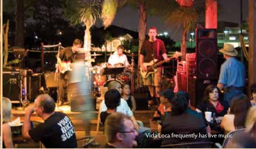
Vida Loca frequently has live music