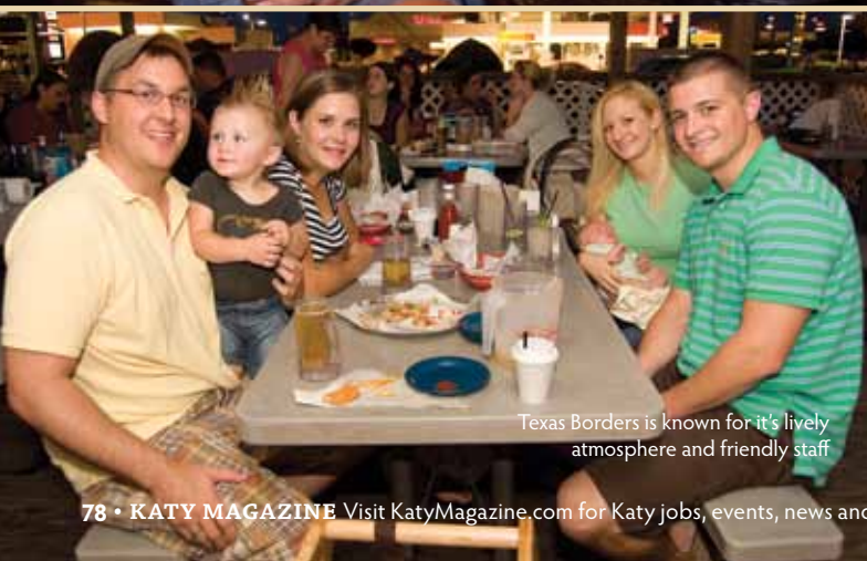
Texas Borders is known for its lively atmosphere and friendly staff