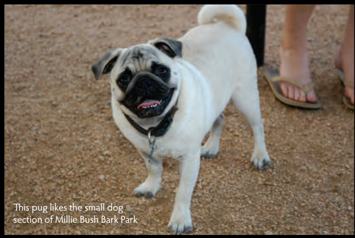
This pug likes the small dog section of Millie Bush Bark Park