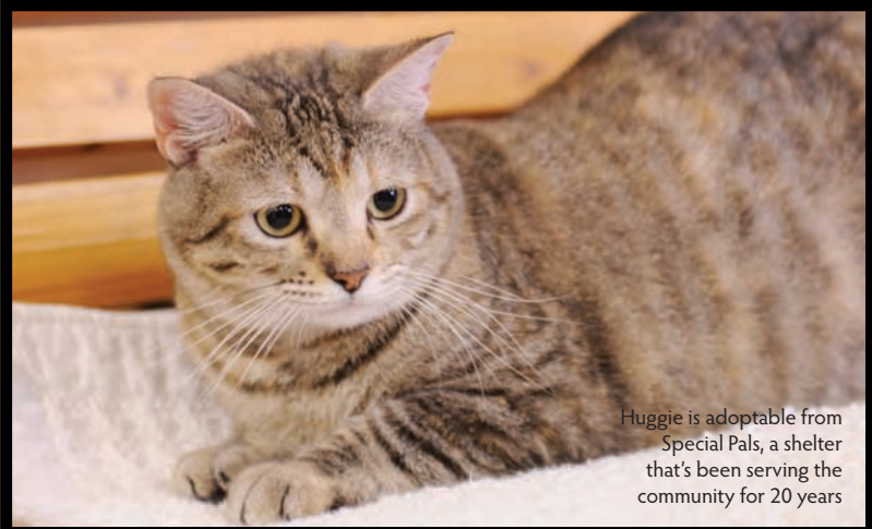
Huggie is adoptable from Special Pals, a shelter that’s been serving the community for 20 years