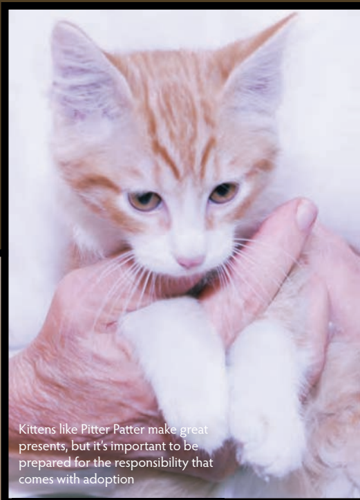
Kittens like Pitter Patter make great presents, but it's important to be prepared for the responsibility that comes with adoption