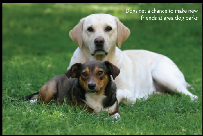
Dogs get a chance to make new friends at area dog parks