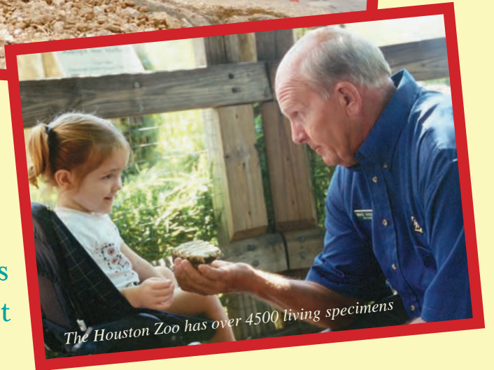
The Houston Zoo has over 4500 living specimens

“A wealth of both individual and family opportunities is only a short drive away”