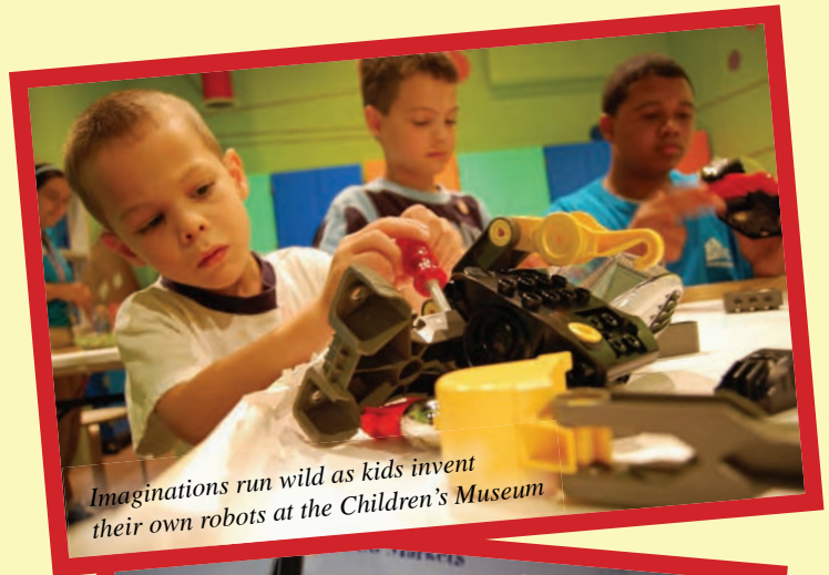
Imaginations run wild as kids invent their own robots at the Children's Museum

Admission for permanent exhibits, college students, children, and seniors is $7, adults are $10. Permanent exhibit halls are open for free on Tuesdays from 2 – 8 p.m.