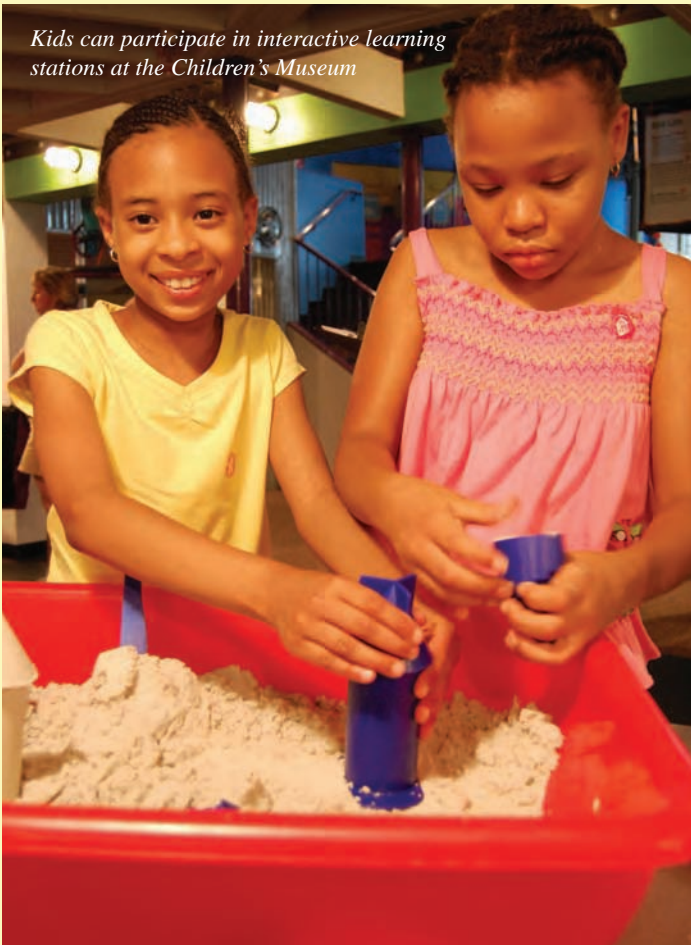
Kids can participate in interactive learning stations at the Children's Museum