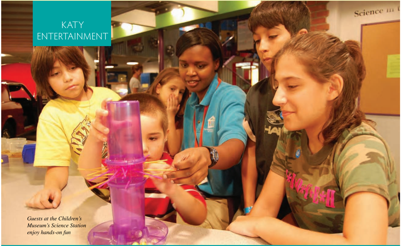
Guests at the Children's Museum's Science Station enjoy hands-on fun