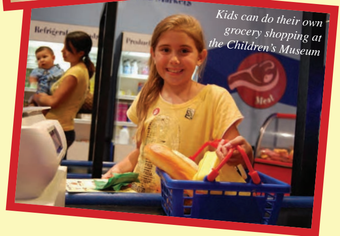
Kids can do their own grocery shopping at the Children's Museum