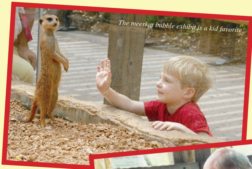
The meerkat bubble exhibit is a kid favorite

The Butterfly and Insect Zoo is a part of the Houston Museum of Natural Science, but like the Planetarium and IMAX, tickets are sold separately. See 50-60 species of butterflies and learn about how to begin a butterfly garden at your own home.