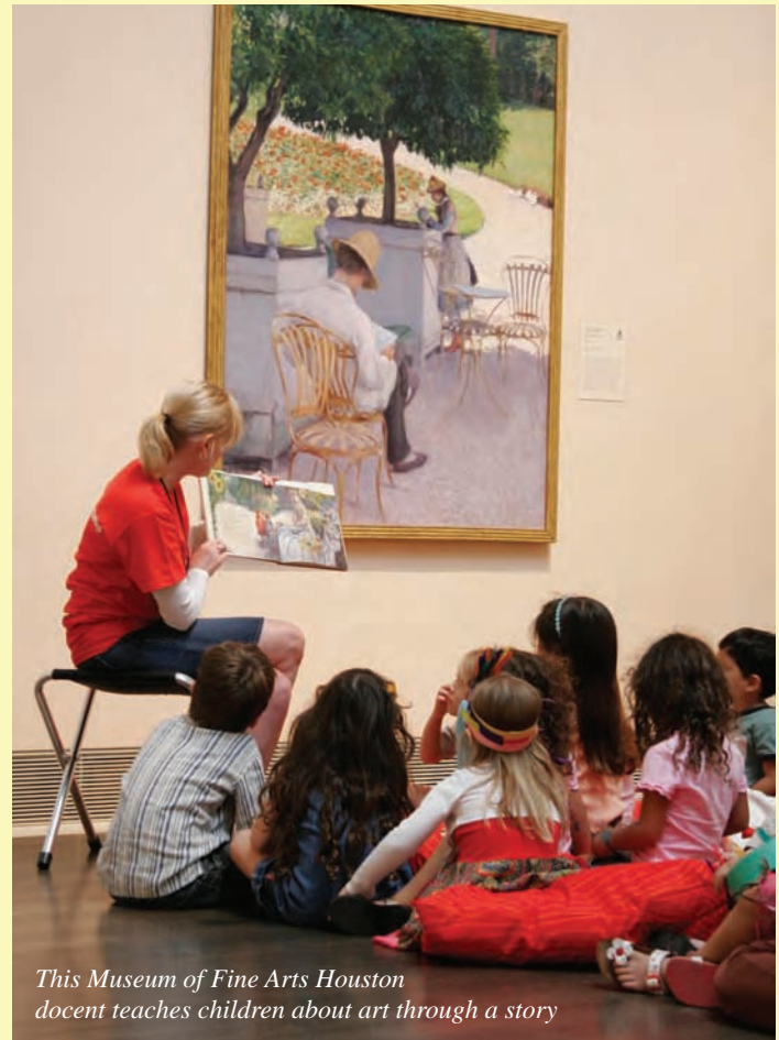
This Museum of Fine Arts Houston docent teaches children about art through a story