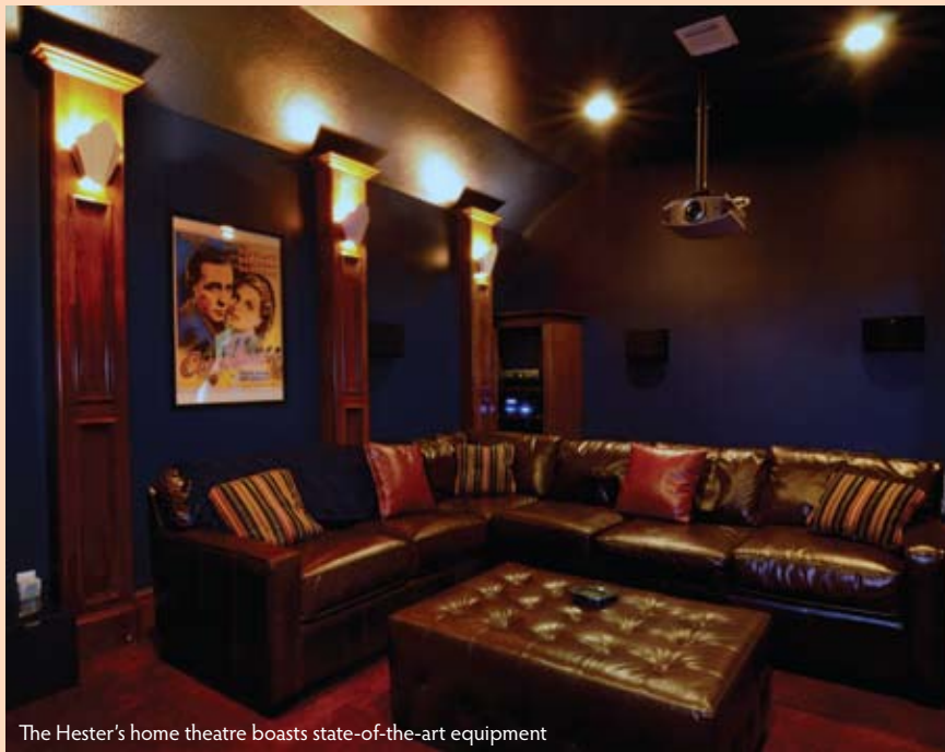
The Hester's home theatre boasts state-of-the-art equipment