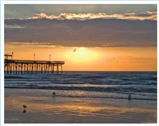
Galveston is a popular getaway for Katy families

A little over an hour's drive from Katy, Galveston offers great fishing, delicious seafood, and beaches for the kids. Take your family to the historic Strand district or visit Moody Gardens to see one of the largest aquariums in the world or take in a movie at the IMAX theatre. Don't forget to beat the heat at Schlitterbahn before you head back to Katy. South Padre Island, another seaside community just a few hours drive from Katy, has great beaches, fishing and fun in the sun too.