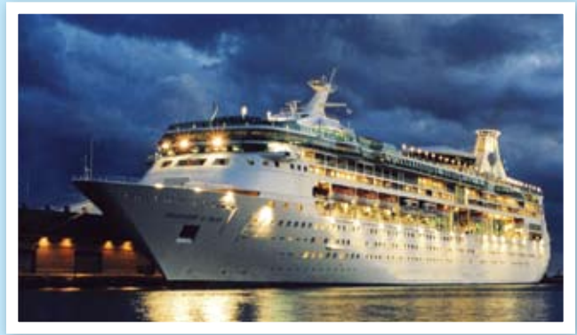
Many Caribbean cruises depart from Galveston