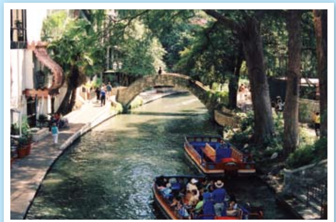
A river boat cruise on San Antonio's Riverwalk

Head west on I-10 for a few hours and you'll drive right into San Antonio where you can sight see and learn about history. A trip to the Alamo is free, offers great lessons on Texas history, and is within walking distance of the famous San Antonio Riverwalk. There are many hotels situated along the Riverwalk where you step out of your hotel room and into a fun atmosphere. From