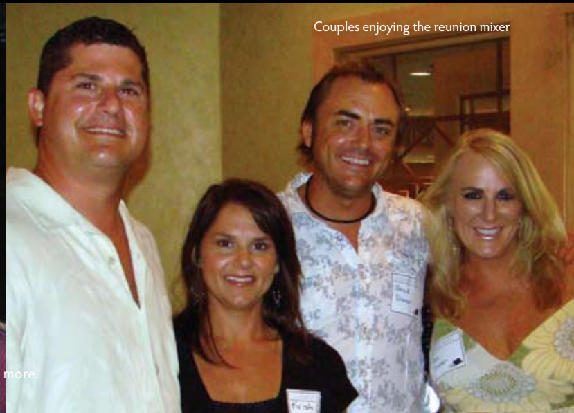
Couples enjoying the reunion mixer