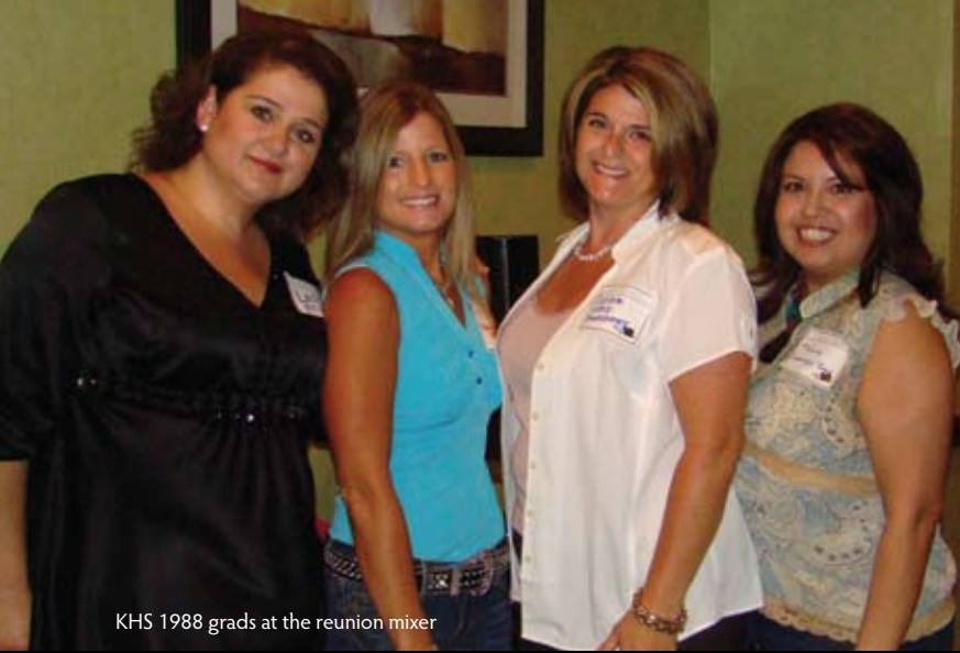
KHS 1988 grads at the reunion mixer