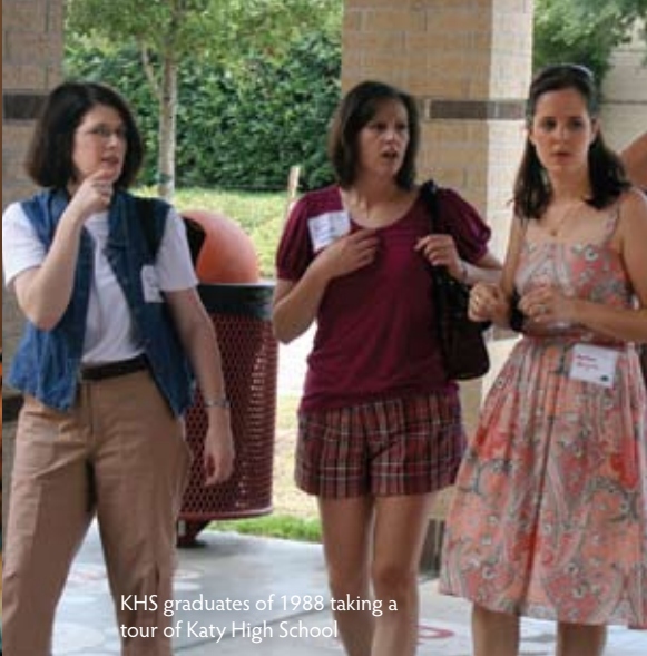
KHS graduates of 1988 taking a tour of Katy High School