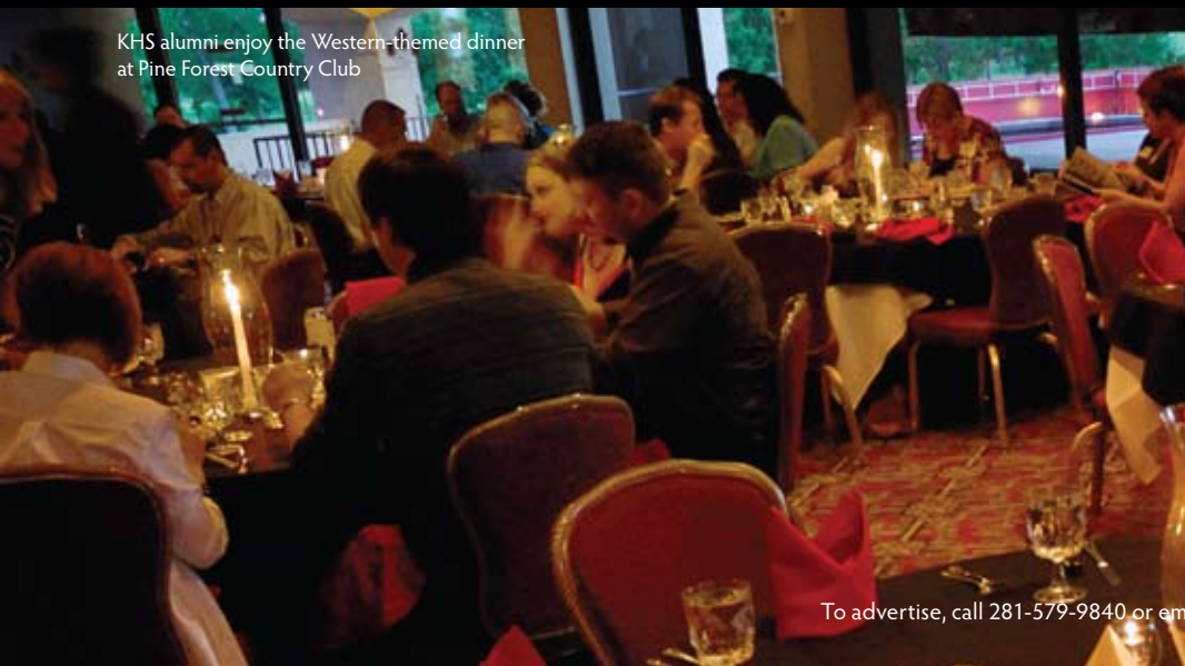
KHS alumni enjoy the Western-themed dinner at Pine Forest Country Club