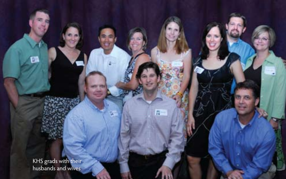
KHS grads with their husbands and wives