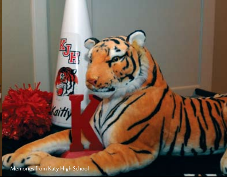
Memories from Katy High School