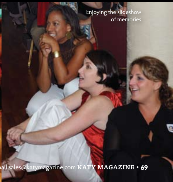
Enjoying the slideshow of memories